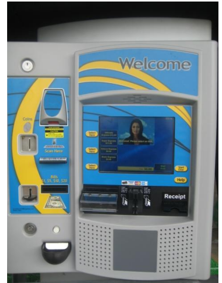
Consumers like the touch-screen capabilities of the SiteWatch Xpress Pay Terminal

This carwash owner continues to sell unlimited plans each month. He has just recently incented his salespeople to focus their sales efforts on unlimited passes, which has increased the number they sell. The unlimited pass consumers accounted for about 5.8% of all washes for the first quarter of 2009, and that number is increasing as more passes are sold.